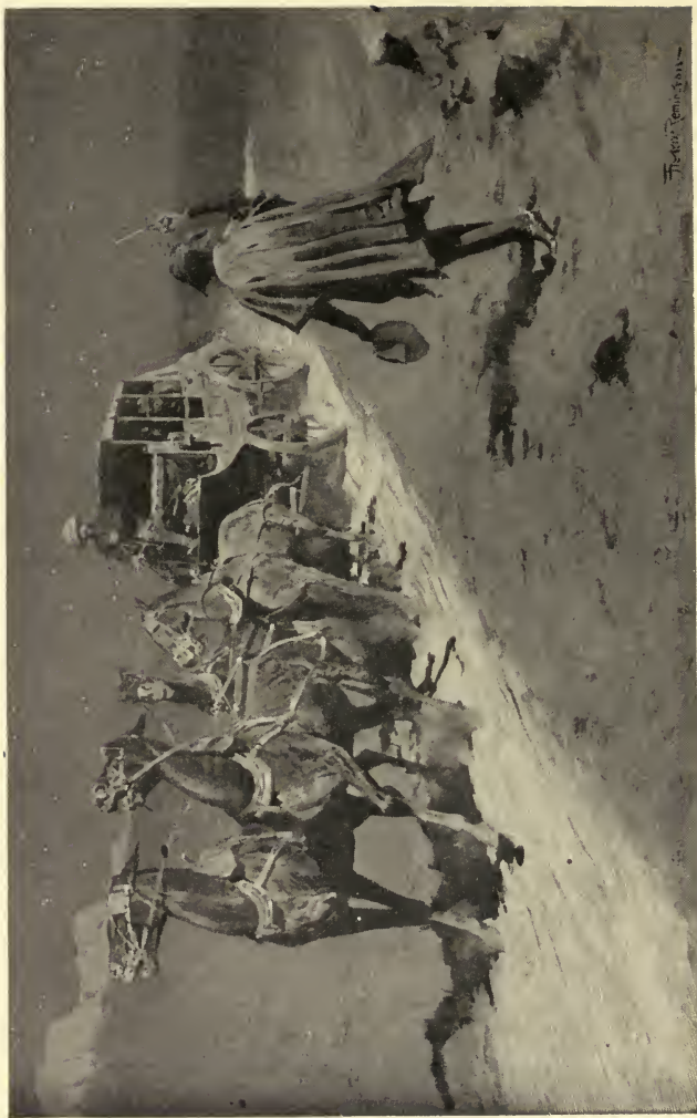
“Throw up your hands,” he commanded.